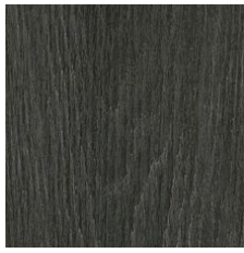
Char 64549 LRV 7.4 V2 - Slight Variation