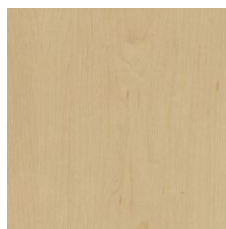
Bare 64200 LRV 43