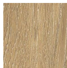
Buff 64140 LRV 30.3