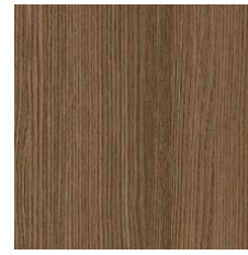
Bark 64720 LRV 14.1 V2 - Slight Variation