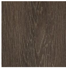
Russet 64760 LRV 7.9 V2 - Slight Variation