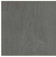
Mercury 64530 LRV 26.9