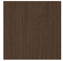
Clove 64740 LRV 8 V2 - Slight Variation