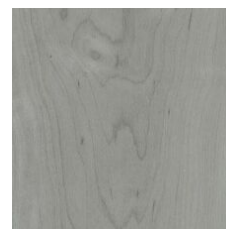
Weathered 64518 LRV 31.8