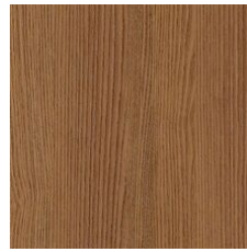
Ginger 64820 LRV 16.7 V2 - Slight Variation