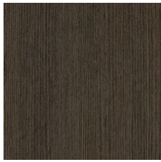
Chickory 64752 LRV 7.3 V2 - Slight Variation