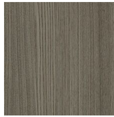
Antler 64761 LRV 18.5 V2 - Slight Variation