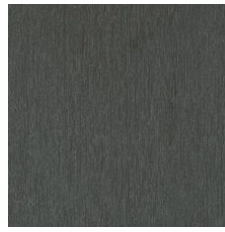
Cinder 64557 LRV 18