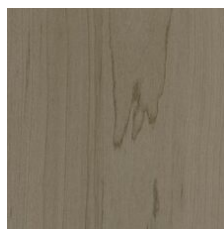
Fog 64327 LRV 22